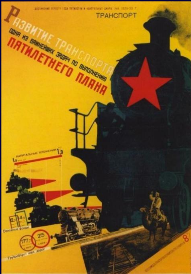
Gustav Klutsis (Russian, born Latvia, 1895 - 1938). The Development of Transportation , 1929. Photo collage, 73.3 x 50.5 cm (28 7/8 x 19 7/8 in.). Museum of Modern Art, New York