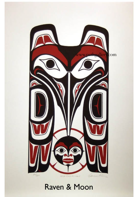
Raven & Moon