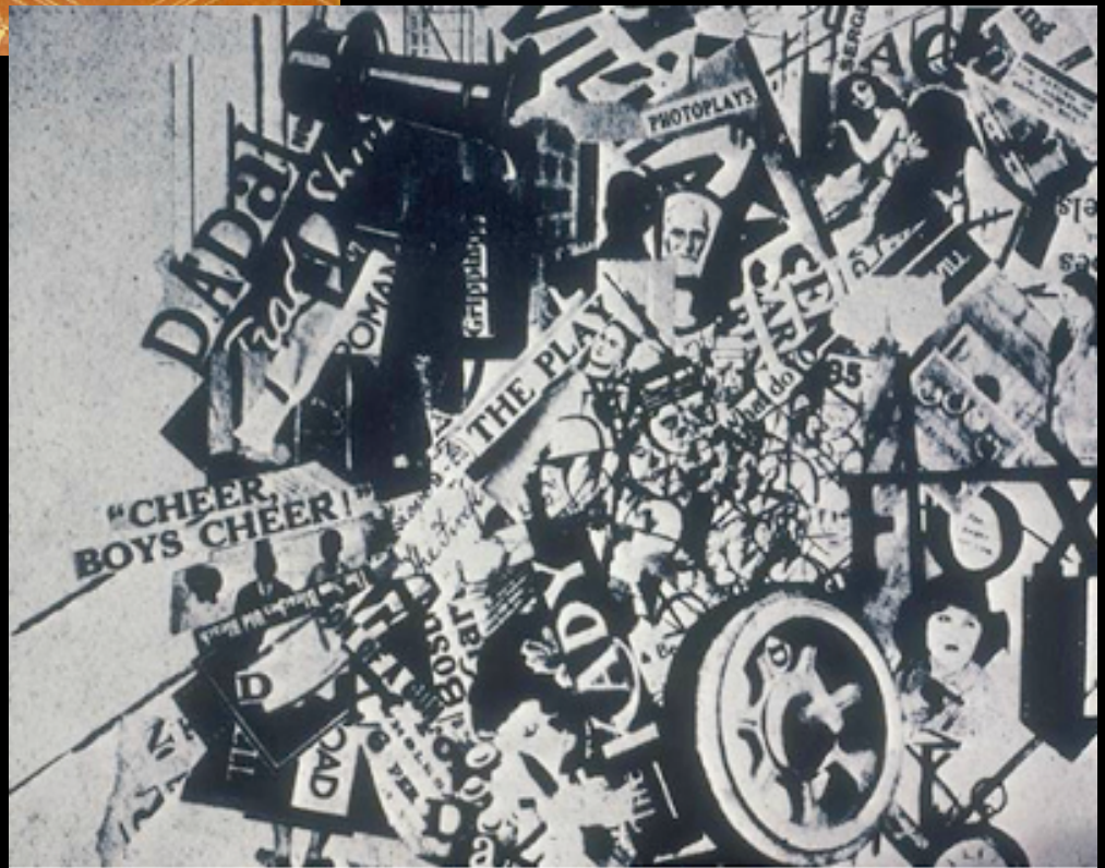
George Grosz and John Heartfield, Life and Activity in Universal City at 12.05 Midday (1919)