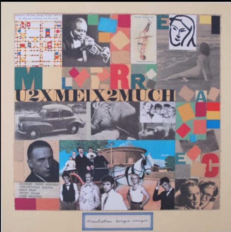
Sir Peter Blake, Manhattan Boogie Woogie (2009)

Texture Text & Image Composition Space Color