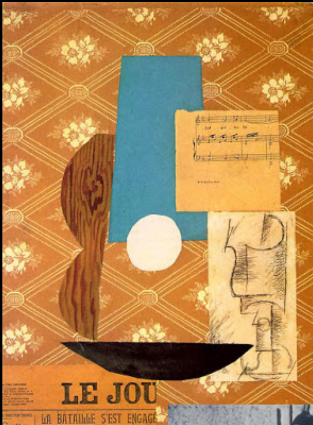
Pablo Picasso, Guitar, Sheet Music and Wine Glass (1912)