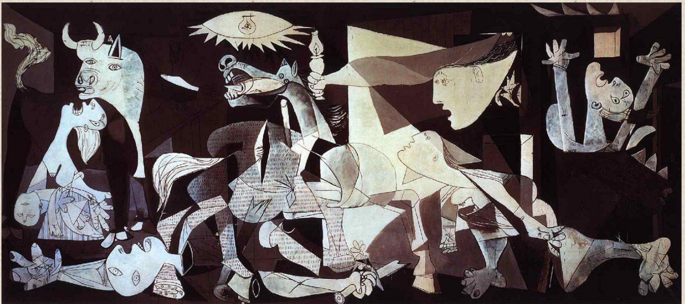
Pablo Picasso, Guernica , 1937