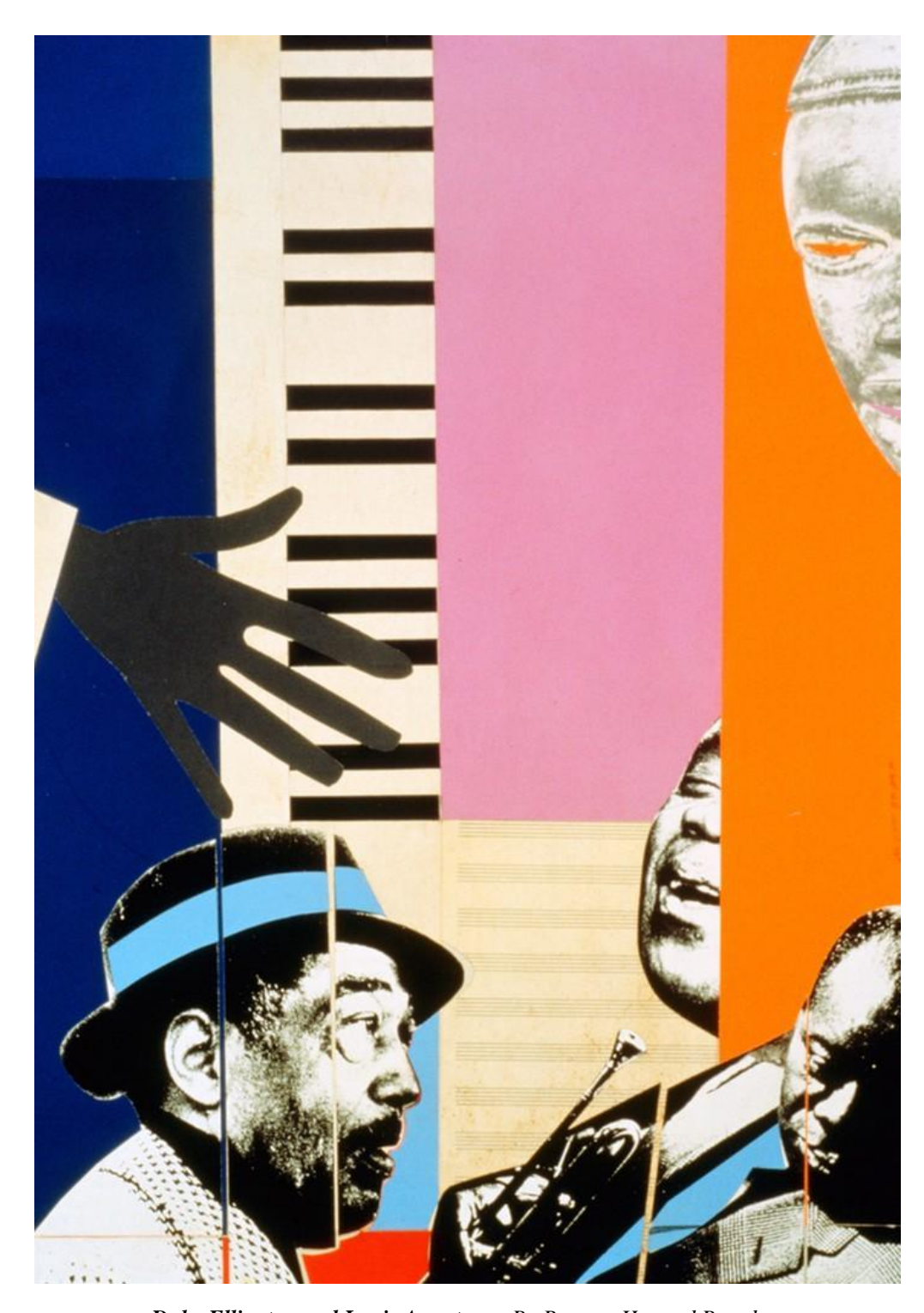
Duke Ellington and Louis Armstrong By Romare Howard Bearden.

Graphic Design and Illustration. <a href="https://library.artstor.org/asset/LARRY_QUALLS_1039764831">https://library.artstor.org/asset/LARRY_QUALLS_1039764831</a>.