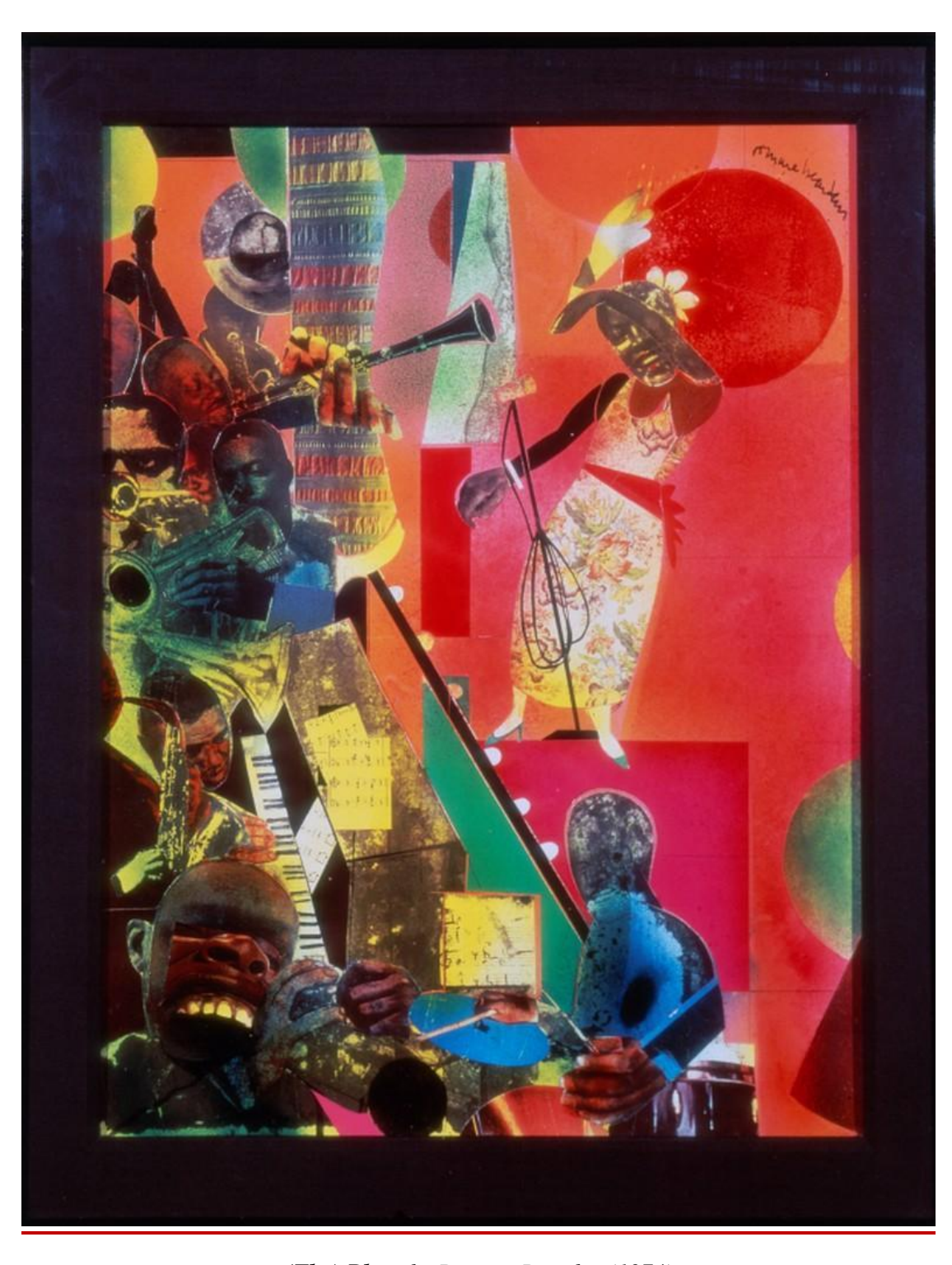
(The) Blues by Romare Bearden (1974)

{\it https://library.artstor.org/asset/ABEARDENIG\_10313650488}.