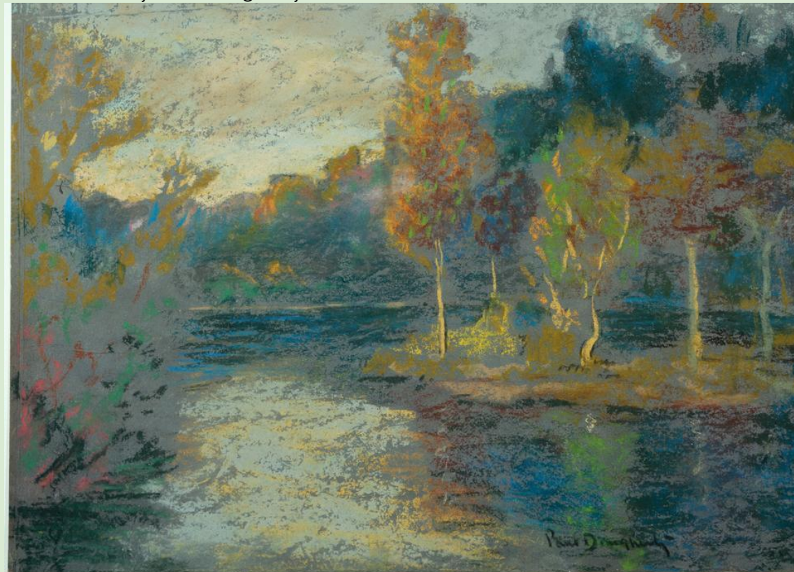
River Scene by Paul Dougherty

Science: Why does water sometimes act as a mirror? Explore how light reflects off of water to create mirror like images.