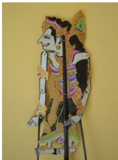
Sita (Princess and heroine)