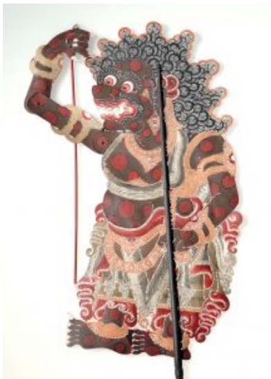
Ravana (Demon King and bad guy/villain)