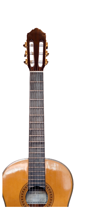
Figure 2 A modern Classical Guitar

The CLASSICAL GUITAR is a string instrument, in which the six strings are plucked using fingers (and fingernails). Its current shape and construction technique were developed at the beginning of the 20<sup>th</sup> century by the Spanish guitar maker Antonio de Torres. Previously, the guitar had a smaller body, a variable number of strings, and several but similar shapes.