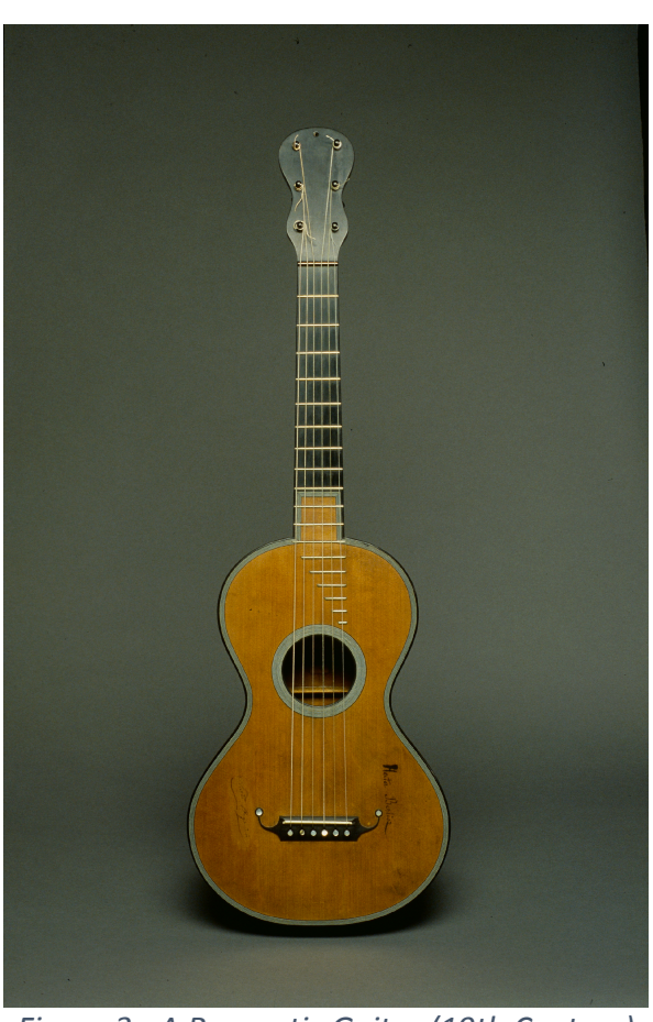
Figure 3 - A Romantic Guitar (19th Century)

The guitar is a relatively low instrument. It is called "transposing instrument" because it produces sounds that are actually lower than the one written on the music staff.