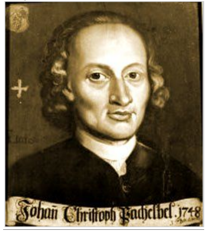
2) JOHANN PACHEBEL