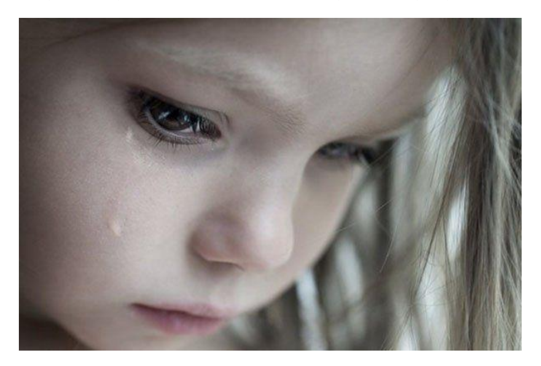
PART II: APPLICATION

Crying, covering their face, wide eyes, sweating, even laughing