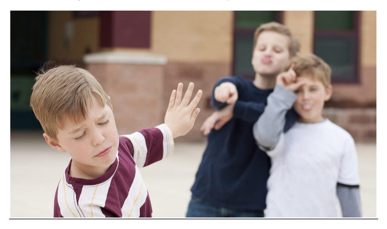
PART III: GROUP ENGAGEMENT

Let's share some of our Bully Bans. Student are called on to share their own Bully Bans. Revise their Bully Bans if needed. EG., "don't be stupid" to "don't be mean"