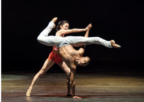
In this contemporary ballet, the female is leading the man, which is avant-garde in comparison to the traditional ballets