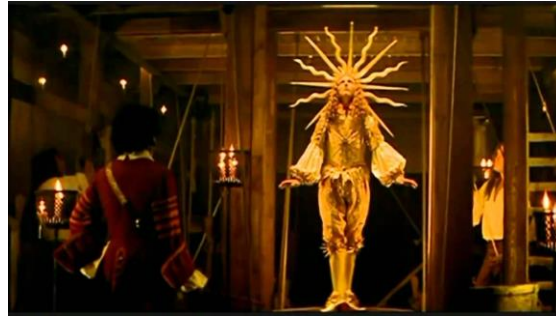
Louis XIV Performing