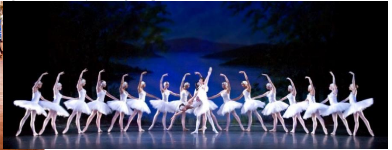
Court Dance in Versailles