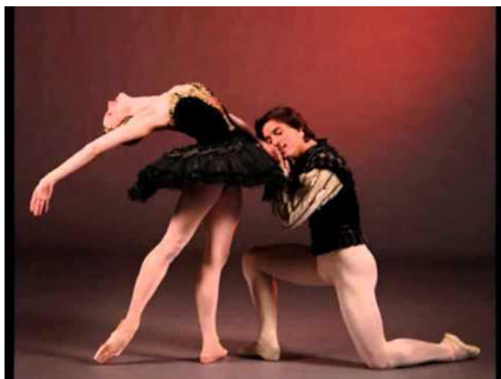
Pas de Deux (Duets)

Ballerinas wear point shoes. Ballets usually represent love stories between Princes and Princesses.