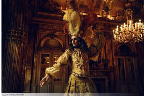
Louis XIV Performing