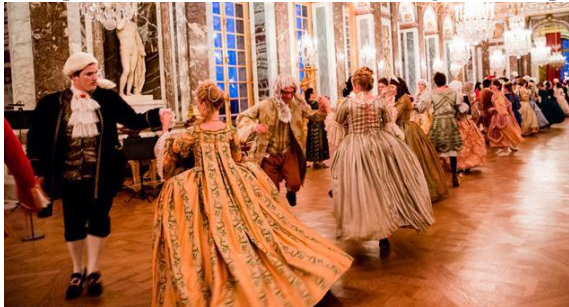
Famous Ballet Swan Lake

Europeanist Aesthetics: God-Like, Lightness, Up-right, Monarchy, Straight Sp