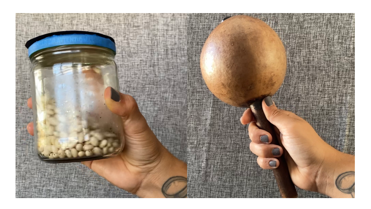
Stills from video element "Making a maraca"

The maraca must be held from the bottom area, holding its grip with the palm of your hand. If your maraca doesn't have a grip, you can hold it by the box of resonance or it's body (higuera). In order to be able to play the maraca is important to know that the movement must initiate from the wrist. By moving your wrist back and forward, you will maintain the seeds inside the maraca in a constant and continuous motion.