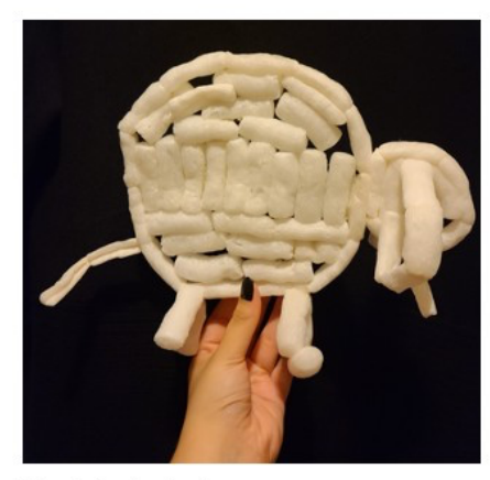
Ensure to let your animal friends to dry for ten minutes so they can last longer! In these minutes you can brainstorm names