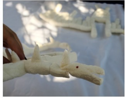
Here are some more detailing examples