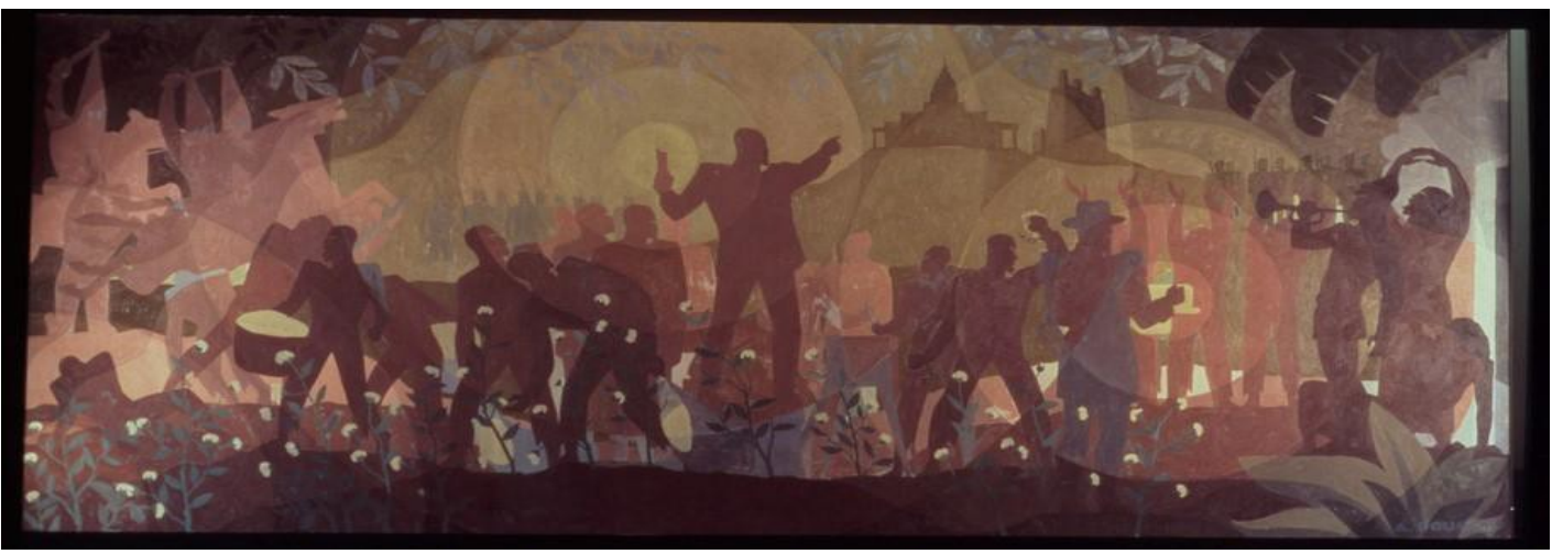
Aspects of Nego Life: From Slavery Through Reconstruction, by Aaron Douglas

"To my mind, it is the duty of the younger Negro artist, if he accepts any duties at all from outsiders, to change through the force of his art that old whispering 'I want to be white,' hidden in the aspirations of his people, to 'Why should I want to be white? I am a Negro—and beautiful!'"