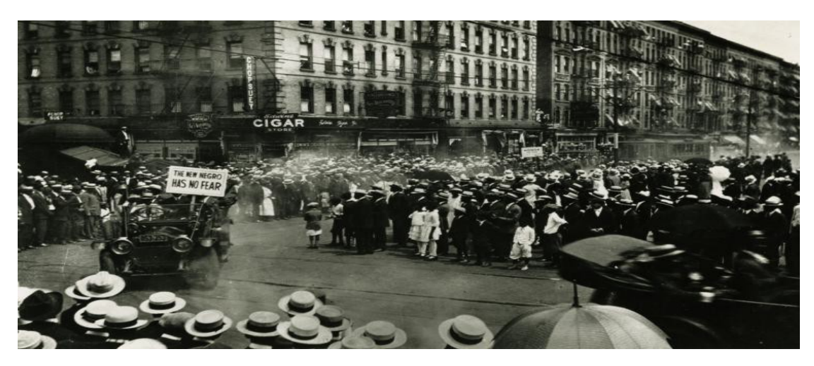
UNIA parade in Harlem, 1920