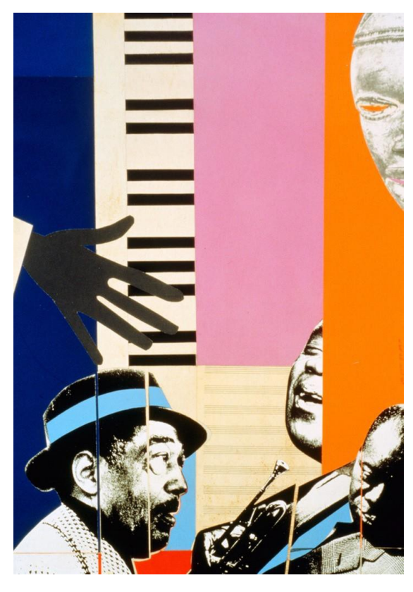
Duke Ellington and Louis Armstrong By Romare Howard Bearden.

Graphic Design and Illustration. https://library.artstor.org/asset/LARRY_QUALLS_1039764831.