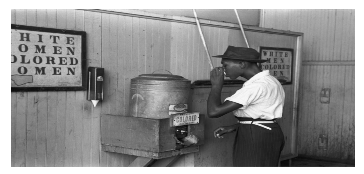
A man drinks at a segregated drinking fountain, 1939