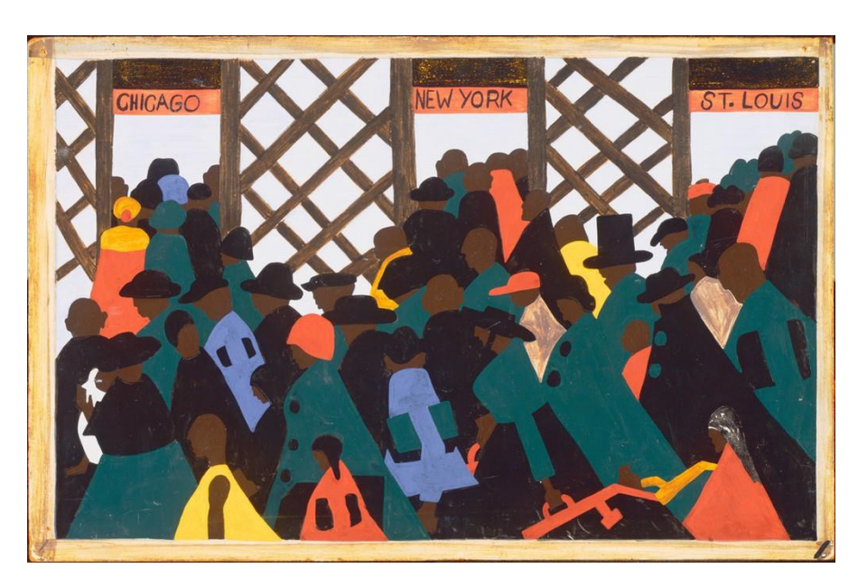
The Migration of the Negro Panel no. 1. By Jacob Lawrence, Place: The Phillips Collection