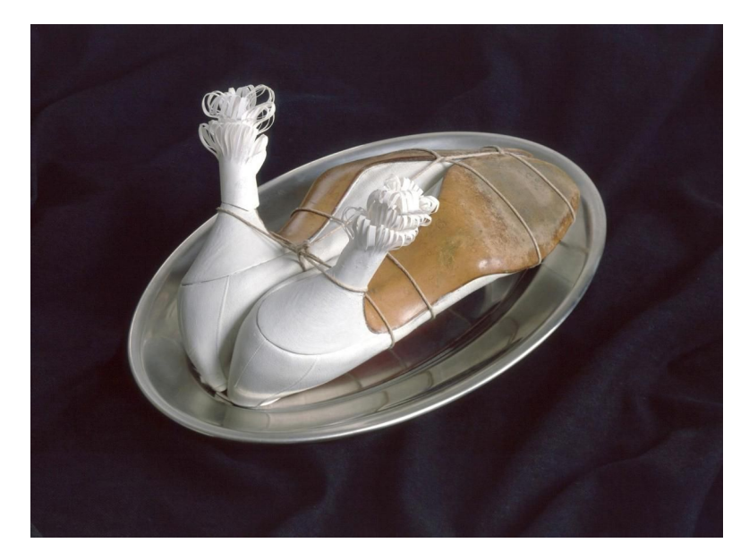
Meret Oppenheim, Ma Gouvernante , metal plate, shoes, string, paper, 1936, Moderna Museet. Sweden.

You might have noticed that both Man Ray's and Meret Oppenheim's artworks make the objects included totally useless. For instance, the tacks on Man Ray's The Gift make it impossible to use the iron to actually iron clothes, and the fur on Meret Oppenheim's Object makes it difficult to drink out of the teacup.