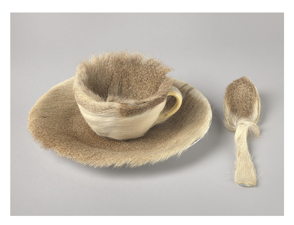
Meret Oppenheim, Object , fur and tea set, 1936, Museum of Modern Art

Meret Oppenheim was a German-born 20th century artist who created many 3-D collages. Like Man Ray, Meret Oppenheim's artworks were often nonsensical.